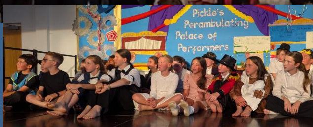
The Greatest Show

Together we grow in God's love, learning to be the best we can be.